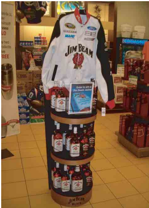
Brownsville Store, TX - Beam Global Spirits & Wine

B aja Duty Free is thankful for the continuous support from suppliers. The stores appreciate the efforts to provide Baja with materials for displays, support in celebrating holiday events and the constant participation in our success.