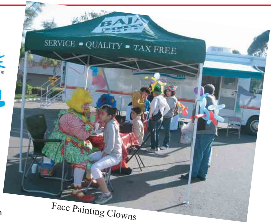
Face Painting Clowns

B aja Duty Free in conjunction with Colgate Palmolive promoted the Colgate Bright Smiles, Bright Futures program in the San Ysidro area. The event took place last Saturday March 7th at the Baja store located on Border Village Road. The program consisted of offering free dental screenings to children ages 1-12 years old. Besides the dental van a local radio station broadcasted live while face painting clowns entertained the children.