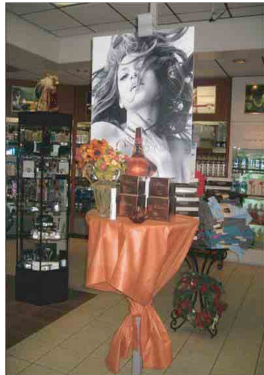
Calexico Store, CA Coty Prestige

B aja Duty Free is thankful for the continuous support from suppliers. The stores appreciate the efforts to provide Baja with materials for displays, support in celebrating holiday events and the constant participation in our success.