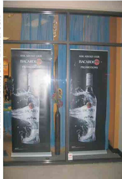
Las Americas Store, CA - Bacardi USA