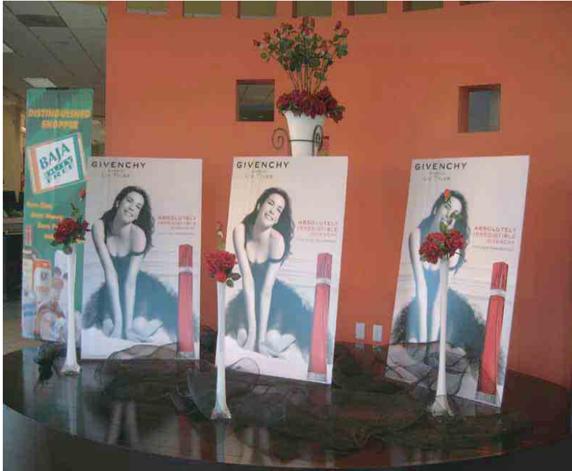
Las Americas Store, CA / Parfums Givenchy